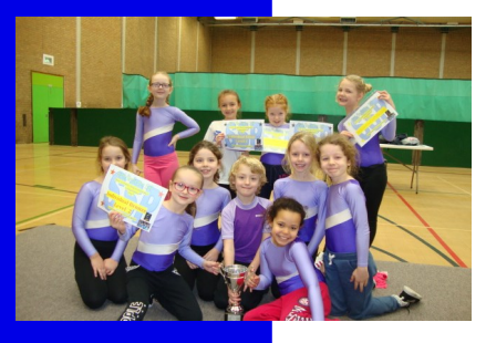
Key Steps Gym Winners West End First School