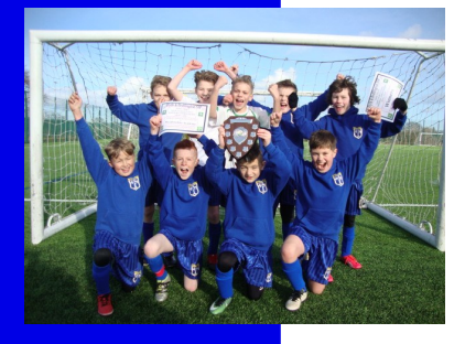
Meadowdale Academy: Winners Year 5 Boys Socce

Competing schools: West End Choppington Bedlington Station New Delaval Malvin's Close Morpeth road Stead Lane