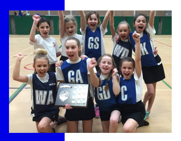
it Bede's RC Primary Ninners Year 5 Netball

Over 100 Year 5 girls from across the Blyth and Bedlington School Sport Programme competed in their first 7-a-side netball tournament at Blyth Sport Centre.